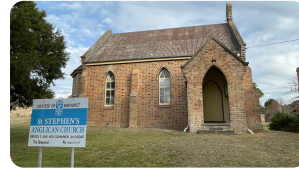
ST STEPHENS TARANA 3:00PM 2ND & 4TH SUNDAY EACH MONTH