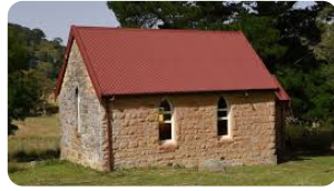
ST THOMAS' HAMPTON 3:00PM 1ST & 3RD SUNDAY EACH MONTH