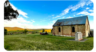
ST PETERS MUTTON FALLS 3:00PM 5TH SUNDAY OF THE MONTH