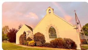
ST BARNABAS OBERON 9:00 AM EVERY SUNDAY