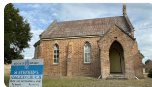
ST STEPHENS TARANA 11:00AM 2ND SUNDAY EACH MONTH