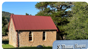
ST THOMAS' HAMPTON 11:00 AM 1ST & 3RD SUNDAY EACH MONTH