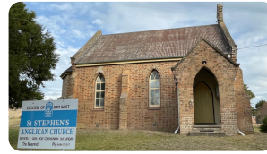
ST STEPHENS TARANA 11:00AM 2ND SUNDAY EACH MONTH