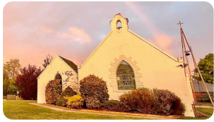
ST BARNABAS OBERON 9:00 AM EVERY SUNDAY