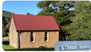
ST THOMAS' HAMPTON 11:00 AM 1ST & 3RD SUNDAY EACH MONTH