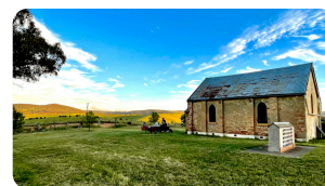
ST PETERS MUTTON FALLS 3:00PM 5TH SUNDAY OF THE MONTH