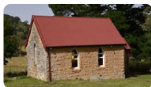
ST THOMAS' HAMPTON 3:00PM 1ST & 3RD SUNDAY EACH MONTH