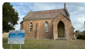
ST STEPHENS TARANA 3:00PM 2ND & 4TH SUNDAY EACH MONTH