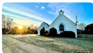
ST BARNABAS OBERON 9:00 AM EVERY SUNDAY